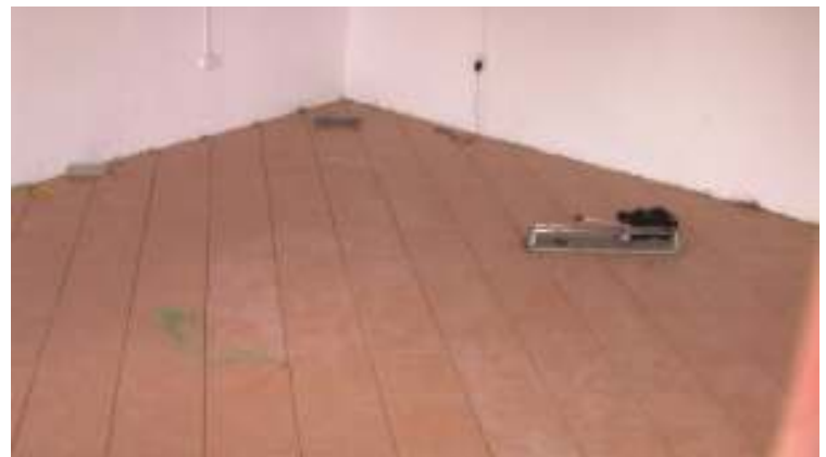
Completed ceramic floor in new office