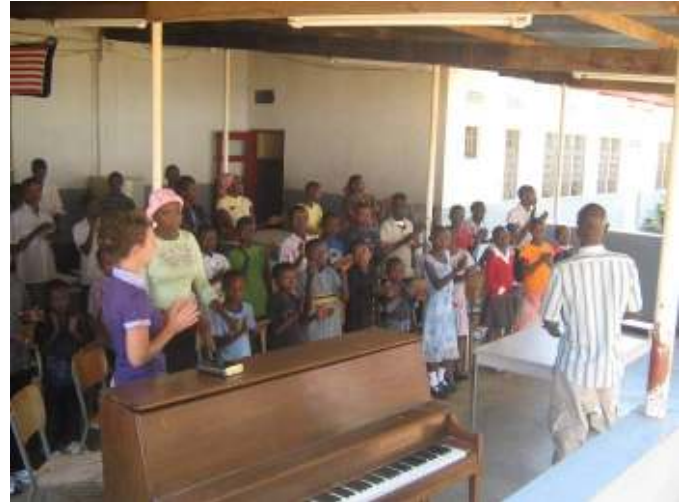
We have moved a piano into the current kitchen area for services.