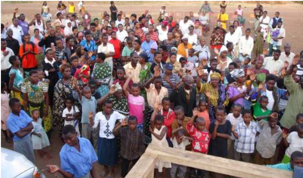
People Gathering in Moshi for the first day of the crusades.