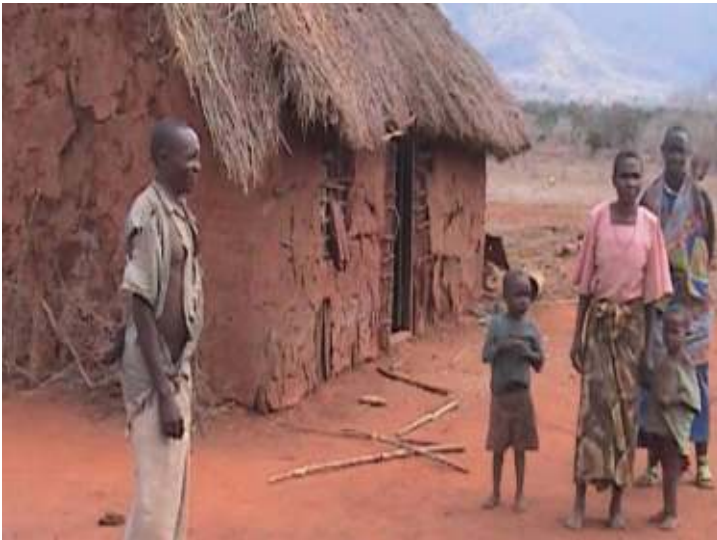
A pathetically poor family outside of their home