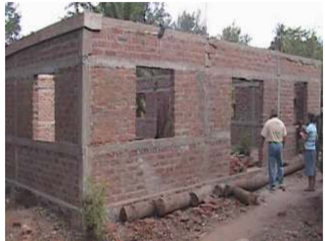
New Church walls complete in Gonja