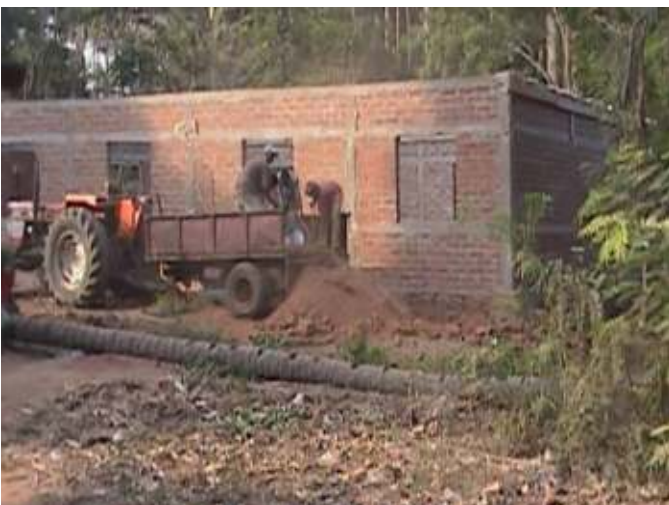
Tractor delivering one of the many, many fill loads for the floor on the church

The church in Gonja now has the cement floor poured complete and they are starting on the manufacturing of the roof trusses. It is a wonderful thing to see a church going up right in the heart of a Muslim region. But look for yourself, it is happening! By Gods grace we will dedicate this building on our January trip. What an exciting time!!