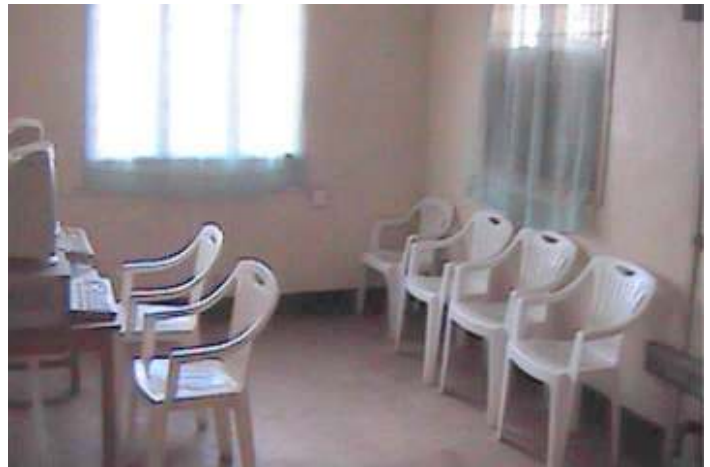
Inside classroom area