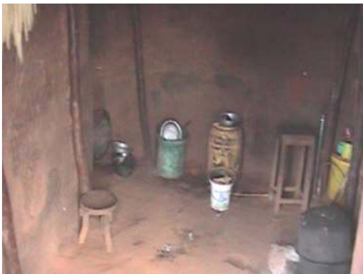
Inside of this family's home. A few bananas is all of the food that is present.

If you are ever wondering why we are so persistent in shipping rice and food and feeding the hungry this may help you to understand. It would be impossible to ship enough to relieve the pain of all but we are doing our best as God provides, and you do your best, to help us with the finances that supply these needs. Let these few pictures talk to your heart. Don't glance at them, please look closely.