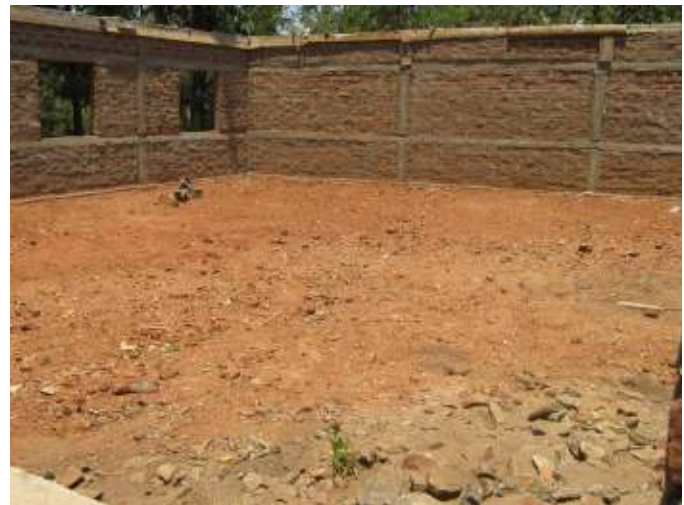
Inside floor in the Gonja church filled and ready for cement. The cement floor is now fully poured.