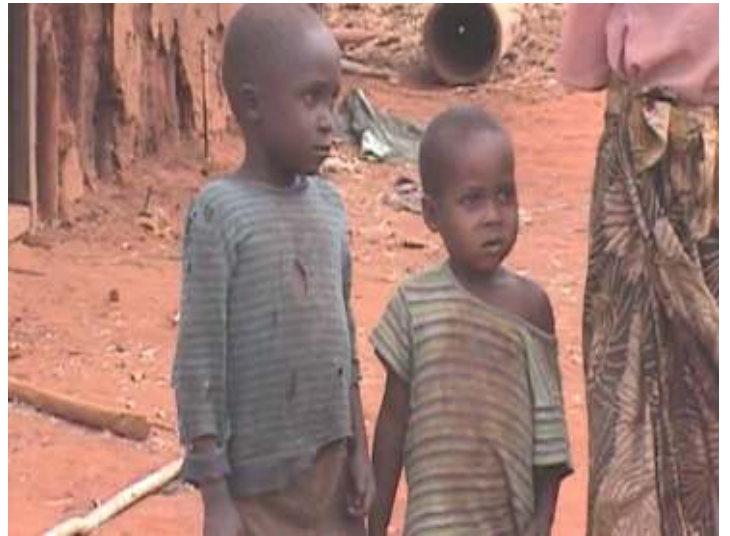
Tattered and hungry children. Two of thousands and thousands.

As we were traveling to Gonja deep, deep into the teeth of the worst part of Tanzania, Africa we decided to take a little detour and go into one of the many, many pitiful villages to visit the people first hand as they live. What we saw will stun even the strongest person and the pictures will never tell you what is actually in these regions.