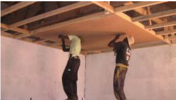
Workers installing finished ceiling in new orphanage