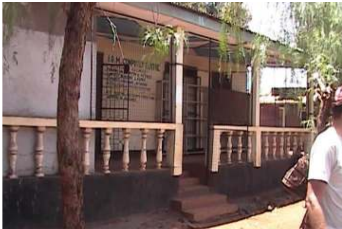
Main entrance to new Bible Training Center

The next morning while preaching in Himo, I mentioned this and after church a man walks up to me and made available a building in Himo that certainly will give us a start towards a goal that only God knows we will reach.